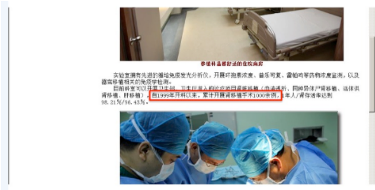
Figure 5. Guangdong No.2 Provincial People’s Hospital Organ Transplant Department Intro page (archived on July 1, 2014)

Scroll down on the same page, as shown in Figure 5, it has a picture of the hospital ward and a picture of a kidney transplant in action. The paragraph right in between the pictures stated: “Since 1999, our department has cumulatively conducted over 1,000 kidney transplants.”