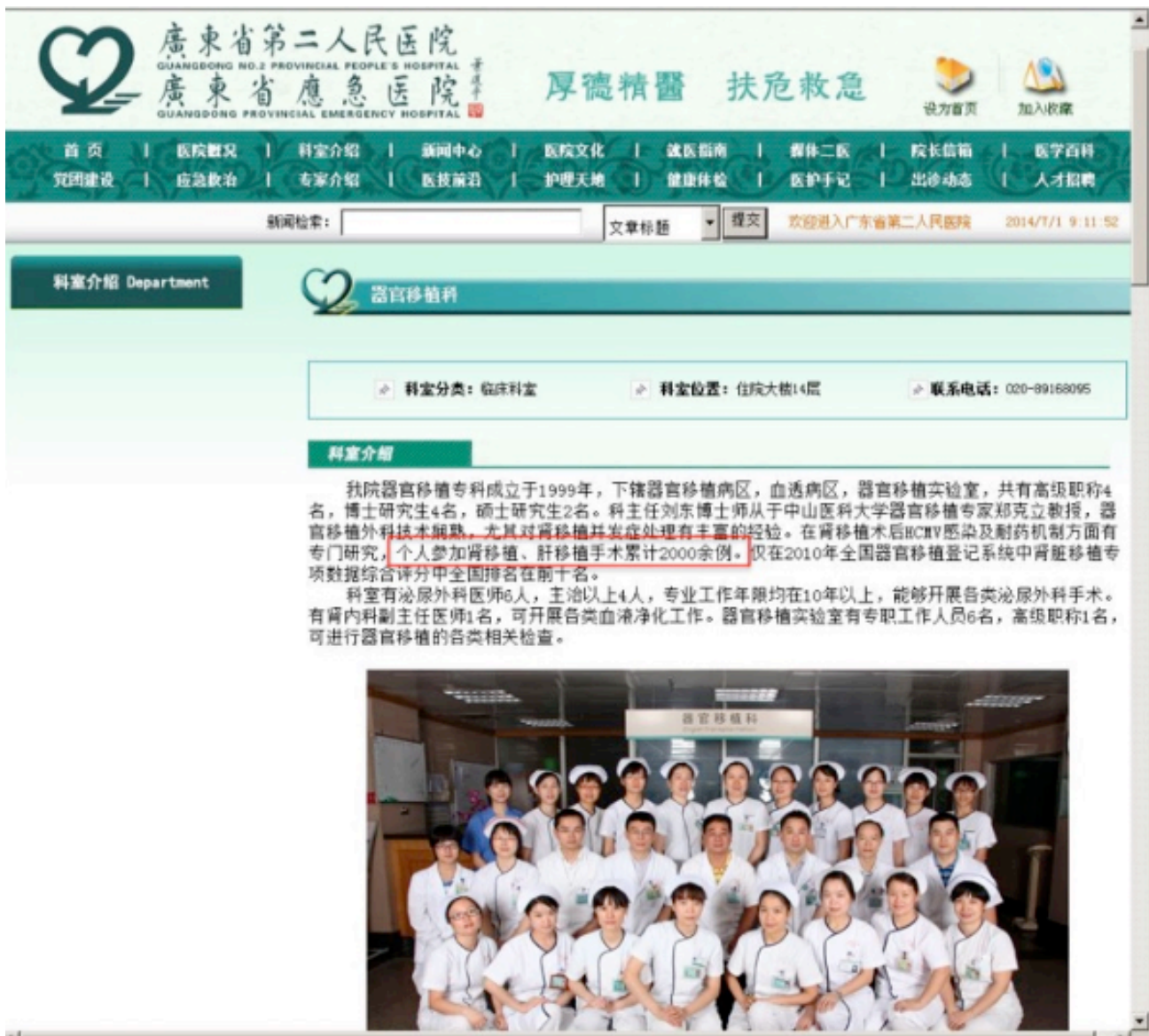
Figure 4. Guangdong No.2 Provincial People's Hospital Organ Transplant Department Intro page (Archived on July 1, 2014)