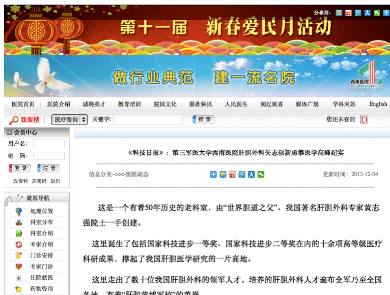
Figure 1 Article on Southwest Hospital's website dated Dec. 4, 2013

On the website of Southwest Hospital, there is an article dated Dec. 4, 2013 as shown in Figure 1. The article is entitled "No. 3 Military Medical University Southwest Hospital Institute of Hepatobiliary Surgery striving to climb the peak of medical technology [1] ."