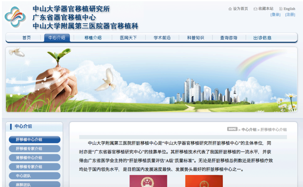
Figure 7 Original homepage of Sun Yat-sen University Organ Transplant Institute at www.organtransplantation.cn (archived copy)

Sun Yat-sen University No.3 Hospital, Sun Yat-sen University Organ Transplant Institute, Guangdong Organ Transplant Center shared the same website, which address used to be www.organtransplantation.cn . It has a suite of webpages detailing its departments and accomplishments. Figure 7 shows the original homepage of the website.