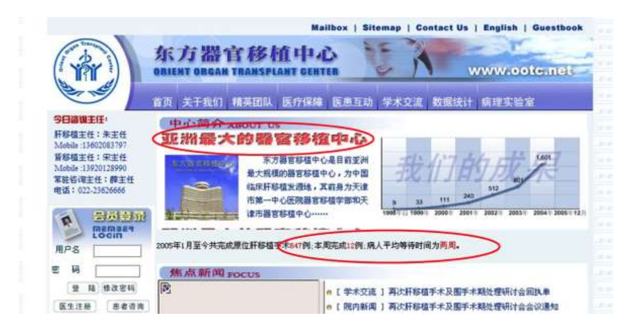
Figure 2: Tianjin No. 1 Central Hospital's Orient Transplant Center website showed that "the average waiting time for a liver transplant is 2 weeks"

Prior to 2006, China International Transplant Network Assistance Center (CITNAC) website operated in Chinese, English, Japanese and Russian. Its Chinese webpage titled "About the Donor" (figure 3) said, "The waiting time for a liver transplant is as short as one month, and no longer than 2 months. For a kidney with perfect HLA matching, the waiting time is as short as 1 week, and no longer than 1 month. If problems, such as fatty liver disease, were found after removing the liver from the chosen donor, the operation can be canceled. CITNAC promises to find another donor and schedule another operation within a week." Without a large, live organ donor bank, where could such confidence come from?