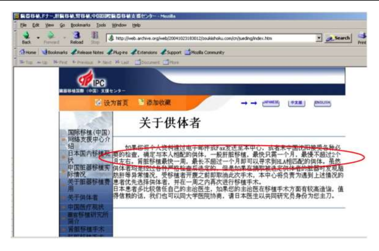
Figure 3: China International Transplant Network Assistance Center provided information for foreign patients in need of organs. Its website advertised 1 to 2 months waiting time for a liver transplant, and 1 week to 1 month waiting time for a kidney transplant. If for any reason the operation was canceled, another operation is guaranteed within a week