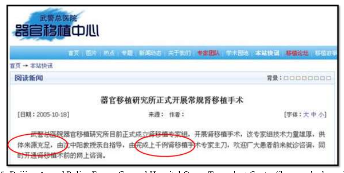
Figure 5: Beijing Armed Police Forces General Hospital Organ Transplant Center "has ample donor kidneys and has surgeons who have performed over a thousand operations."

Beijing Armed Police Forces General Hospital Organ Transplant Center website had an article dated Oct. 18, 2005 (figure 5). The article said, "Now an official kidney transplant team has been formed. We have ample donor kidneys. The team consists of surgeons who have performed over a thousand operations."