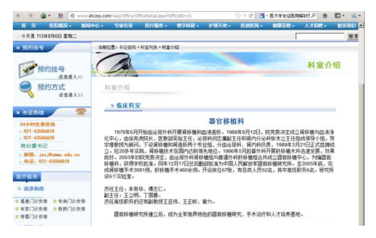
Figure 6: From 2003 to 2005, PLA Organ Transplant Institute in Shanghai performed 3,081 kidney transplants and 460 liver transplants.

On Dec. 17, 2003, Shanghai Changzheng Hospital was designated by the People's Liberation Army (PLA) General Logistics Department to be the PLA Organ Transplant Institute. From then to late 2005, it performed 3,081 kidney transplants and 460 liver transplants (figure 6).