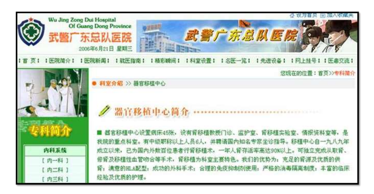
Figure 4: Guangdong Province Armed Police Forces General Hospital's Organ Transplant Center advertised ample high quality donor kidneys, and satisfactory HLA matching

Beijing Armed Police Forces General Hospital Organ Transplant Center website had an article dated Oct. 18, 2005 (figure 5). The article said, "Now an official kidney transplant team has been formed. We have ample donor kidneys. The team consists of surgeons who have performed over a thousand operations."