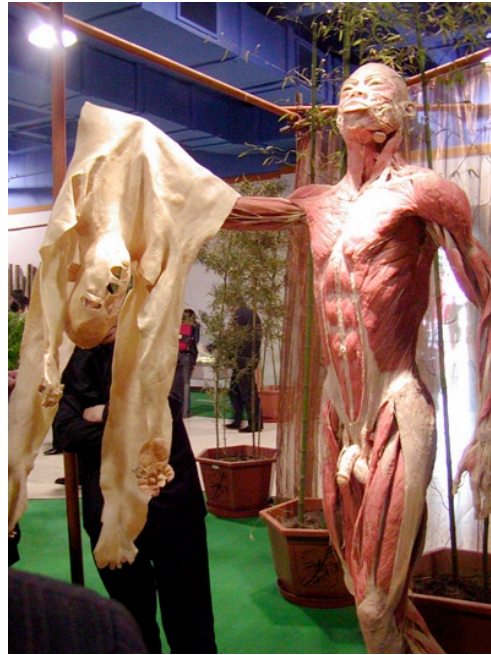
Image 6: Sui Hongjin's the "Skin Carrier" specimen shows a male cadaver holding the complete set of his own skin [57]

hwww.upholdjustice.org Tel: 001-347-448-5790 Fax: 001-347-402-1444