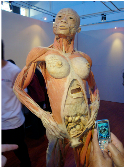
Image9: Full Body Female with Fetus

According to Chinese law, pregnant women cannot be given the death penalty. Even if the woman died in a car accident, her family would be extremely unlikely to allow their loved ones' bodies to be made into human specimens.