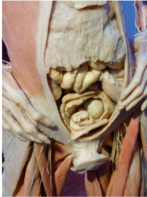
Image8: Female with Fetus Half Body Enlarged Picture

http://www.upholdjustice.org Tel: 001-347-448-5790 Fax: 001-347-402-1444