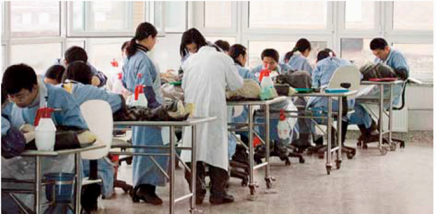
Sektionssaal in Dalian: Plastinatenproduktion am Fließband

hwww.upholdjustice.org Tel: 001-347-448-5790 Fax: 001-347-402-1444