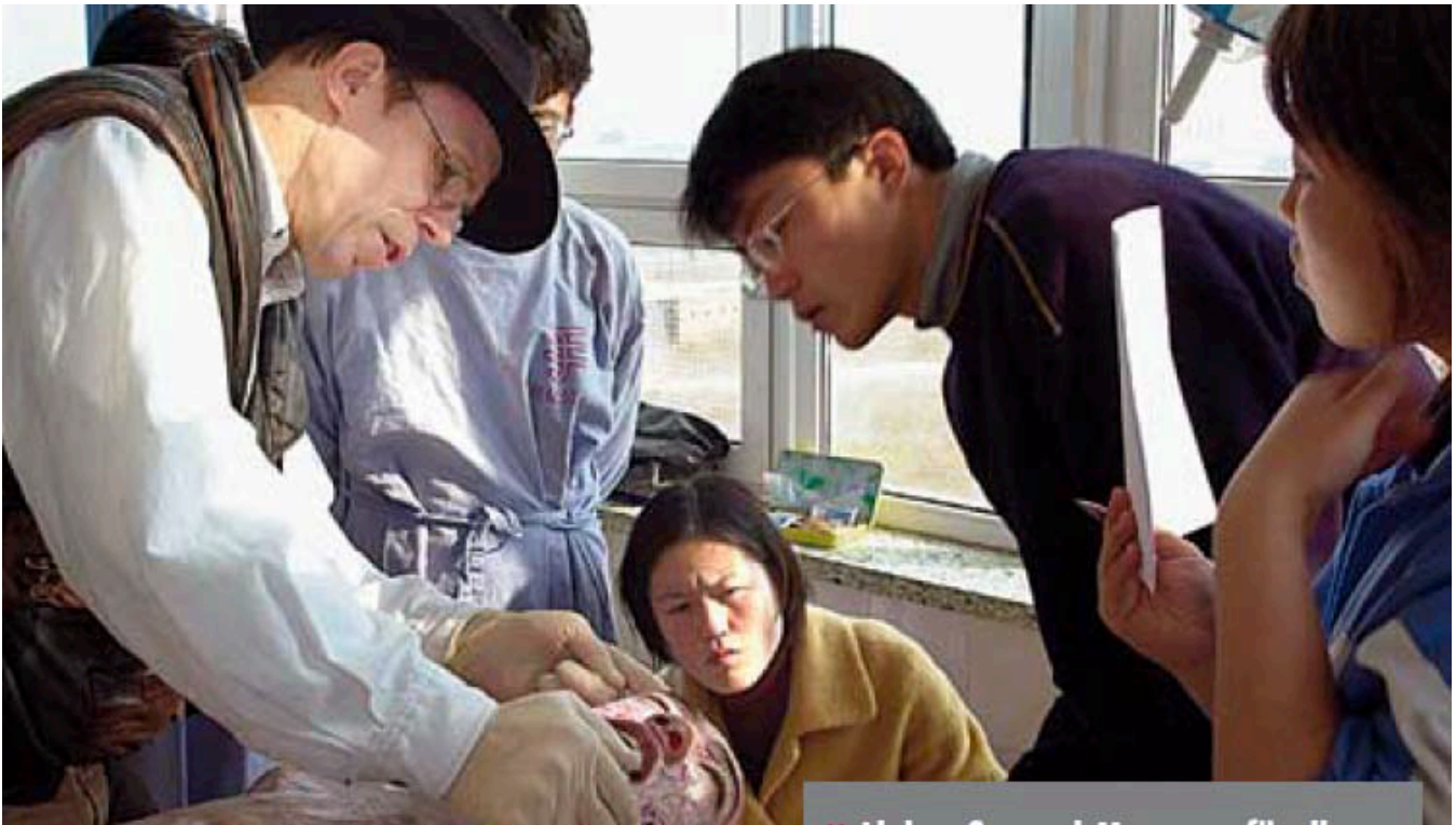
Image 3: Gunter von Hagens teaching Chinese workers plastination techniques at his Dalian Plastination Factory

www.upholdjustice.org Tel: 001-347-448-5790 Fax: 001-347-402-1444