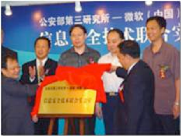
Caption: Third Research Institute of the Ministry of Public Security and Microsoft China Limited “Information Security Technology United Laboratory”

www.upholdjustice.org Tel: 001-347-448-5790 Fax: 001-347-402-1444