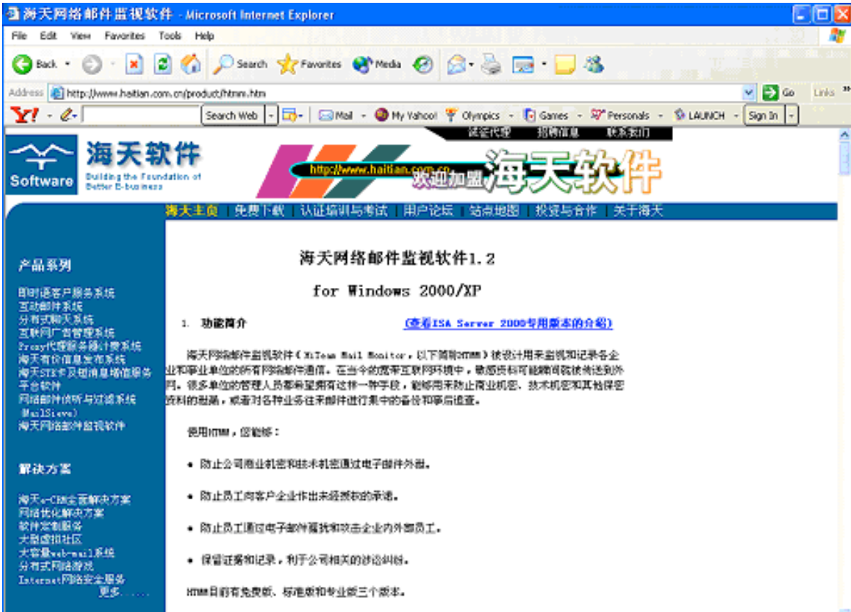
Webpage Capture 1: HTMM, a company Internet security regulation based on Microsoft ISA Server 2000

www.upholdjustice.org Tel: 001-347-448-5790 Fax: 001-347-402-1444