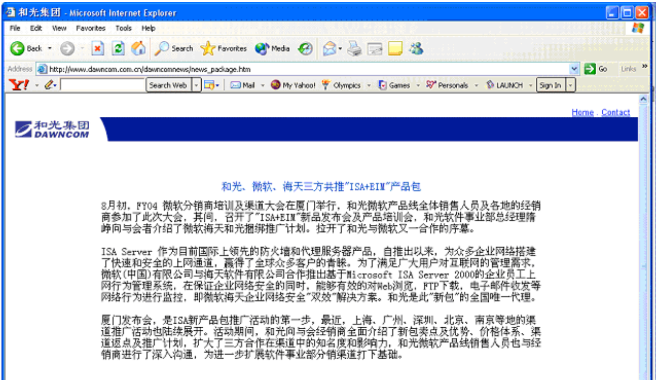
Webpage Capture 4

http://www.upholdjustice.org Tel: 001-347-448-5790 Fax: 001-347-402-1444